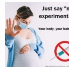
VAERS Data Reveals 50 X More Ectopic Pregnancies Following COVID Shots than Following ALL Vaccines for Past 30 Years