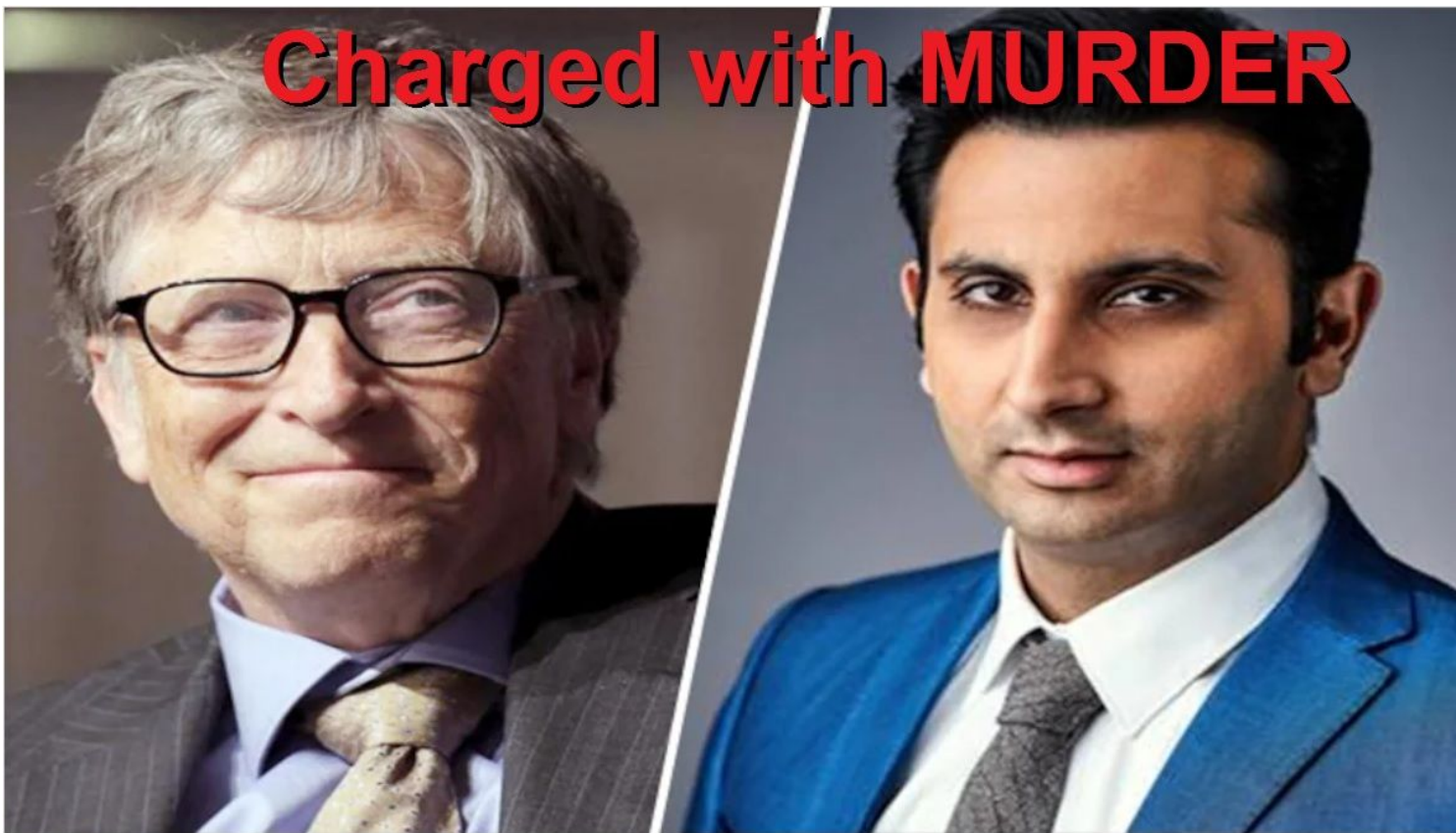
Bill Gates and SII CEO Adar Poonawalla.