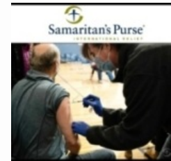
Fully Vaccinated Franklin Graham Has Heart Surgery for Pericarditis as Samaritan's Purse Helps Inject People with COVID-19 Shots