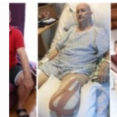
Receiving a COVID-19 Shot

Does India have the ability to run a covert military operation to extract Bill Gates from the U.S., for example, and bring him to trial in India?