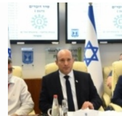
in Israel Weeks before it was "Discovered"